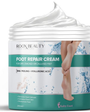
FOOT REPAIR CREAM

IT'S HELPS TO PREVENT DRYNESS AND TENSION ON THE SOLES OF THE FEET AND HEELS. IT PROVIDES A HEALTHY APPEARANCE FOR YOUR FEET AND HEELS